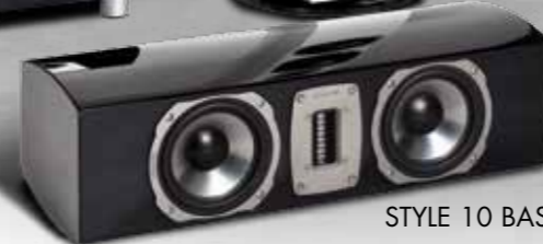
STYLE 10 BASE